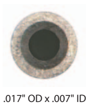
.017" OD x .007" ID

We take polyimide-coated fused silica (FS) and remove the polyimide layer. Then we electrochemically plate the FS with pure nickel. The resulting nickel-plated FS tube provides superior heat transfer to the FS lining, permitting use as a flexible transfer line with the best qualities of silica-lined stainless but with improved heat transfer and a shorter bend radius. The 1/32" OD tubing is available in IDs from .002" to .010". For high pressure applications, we recommend using our 1/32" 316SS ferrules.